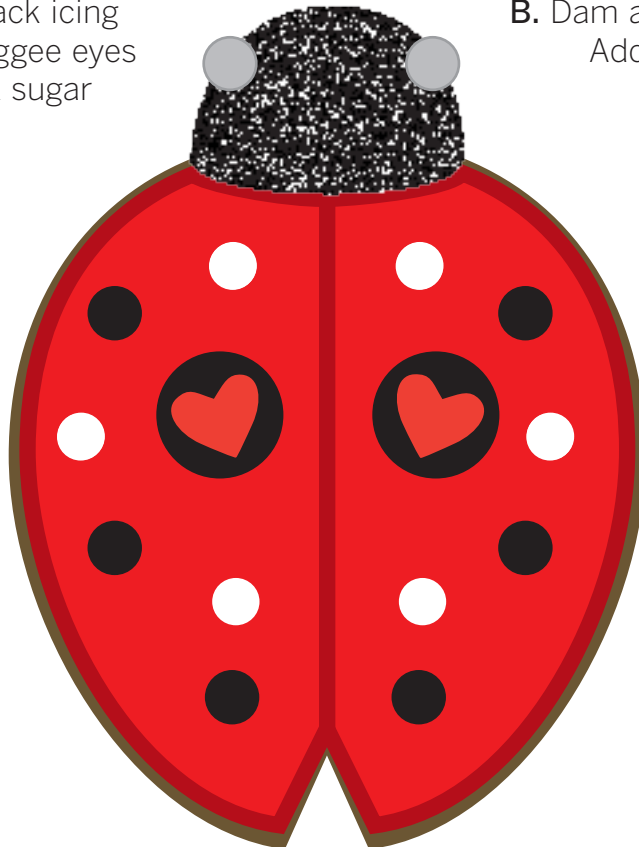
C. Pipe/outline body in red with thin tip bottle Add black dots Place heart candies in large dots