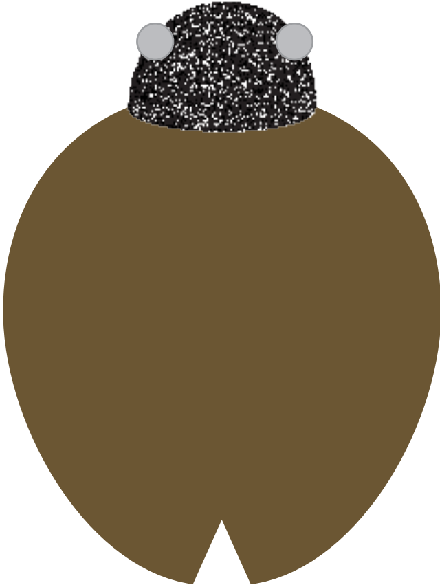
A. Coat head with black icing Add extra large draggee eyes Cover with black sugar