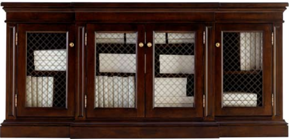
ABOVE | A handsome home for an entertainment system, the Bordelaise-finished Riverdale Breakfront Media Console is notable for the striking open metal grillwork, finished in Vintage Bronze, found in all four of its doors. Inside are adjustable shelves for electronic components and DVDs, while the spacious veneered top accommodates a wide-screen TV.

A clean, modern aesthetic and restrained color palette create an atmosphere of relaxed sophistication in the room shown at right. Inspired by classic Dunbar style, the Cadden Cutaway Scroll-Arm Sofa and Chair share swept-back arms and sculptural profiles that display an undeniable mid-century panache. Both the Beekman Nesting Cocktail Tables and matching Side Table have a glistening contemporary look thanks to a painted Jet finish and inset tops of mirrored Eglomisé glass; close at hand for entertaining, the smaller cocktail tables tuck neatly under the larger until needed. The grille-front Riverdale Library is right at home in these smart environs.