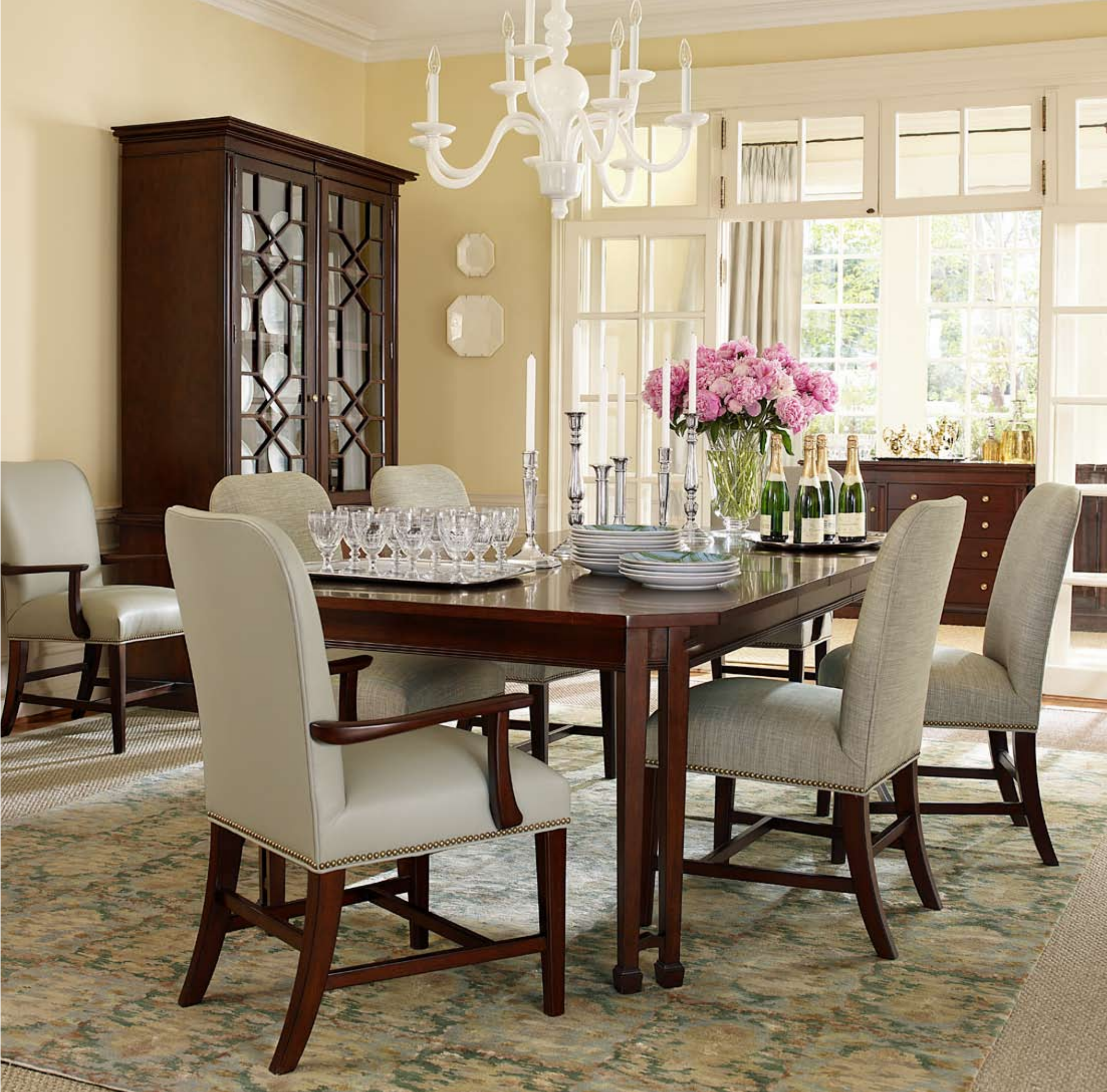
ACCENTS | Veneto Chandelier, Reflection Rug in Water. PAINT: MS110 Pignoli. (See p. 24)