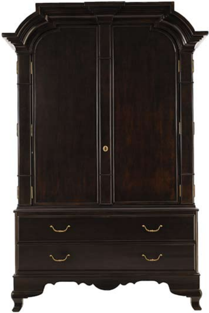
ABOVE | A Gustavian-inspired bonnet top crowns the versatile North River Bonnet Armoire . Finished in Tea Leaf, it functions admirably as both a wardrobe and media cabinet, with lined trays, removable shirt partitions, adjustable shelves, and a three-plug receptacle for electronics. ACCENTS | Milk Glass Lamp, Martha Stewart Framed Photography “Apple Tree and Corn Crib”. (See p. 24.)

The pairing of elaborate turnings with pristine cabinetry helps this welcoming bedroom achieve perfect balance. The Tea Leaf-finished North River Four-Poster Bed features a carefully turned blanket rail and posts, as well as a smooth cap rail along the top of the fancy-face headboard. It can be configured with four tall posts in traditional style, or its foot posts can be removed to create a low footboard profile, as shown at right. Beside it, the North River Bachelor's Chest provides the contrast of pure, Shaker-inspired lines. A concave front offsets the roomy North River Landscape Dresser , while trim detailing in white gold leaf is the sole embellishment on the clean North River Mirror .