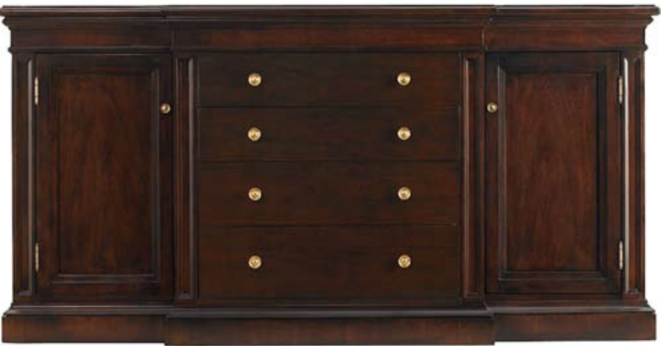
ABOVE | With a shape inspired by an open bookcase of Martha's, the Sutton Breakfront Sideboard has lines and angles that play beautifully off its companion pieces. Finished in Bordelaise, its broad veneered top has a contrasting veneer border to match the dining table and makes a roomy serving area for a buffet.

With slim profiles and refined dimensions, this ensemble—while generous in size—leaves the surrounding room feeling spacious and airy. The Sutton Sheraton Dining Table , while influenced by the work of the master cabinet-maker, is distinctly modern in its simplicity. At its beveled corners, slender double-legs are positioned at the table's outer edge, leaving the underside completely free from obstruction. A contrasting veneer borders its fancy-face mahogany top, finished in velvety Bordelaise. Thin backs give the Sutton Upholstered Armchair and Side Chair their chic silhouettes, upholstered here in an elegant combination of tonal leather and fabric. The Sutton Fretwork China Cabinet displays trim grilles that underscore the room's geometry.